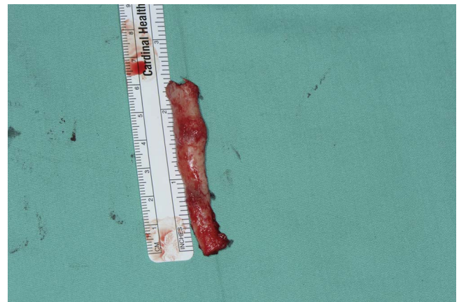
Fig. 4. Intraoperative view of excised styloid process in a patient with Eagle Syndrome.

An external, cervical approach provides the best exposure with the caveat of a scar. This approach begins with an oblique incision made at the angle of the mandible and dissection is carried down to the sternocleidomastoid muscle. The sternocleidomastoid is retracted posterolaterally. Subsequently the space between the parotid gland and the posterior belly of the digastric muscle is explored. The dissection is completed with subperiosteal dissection onto the styloid process and