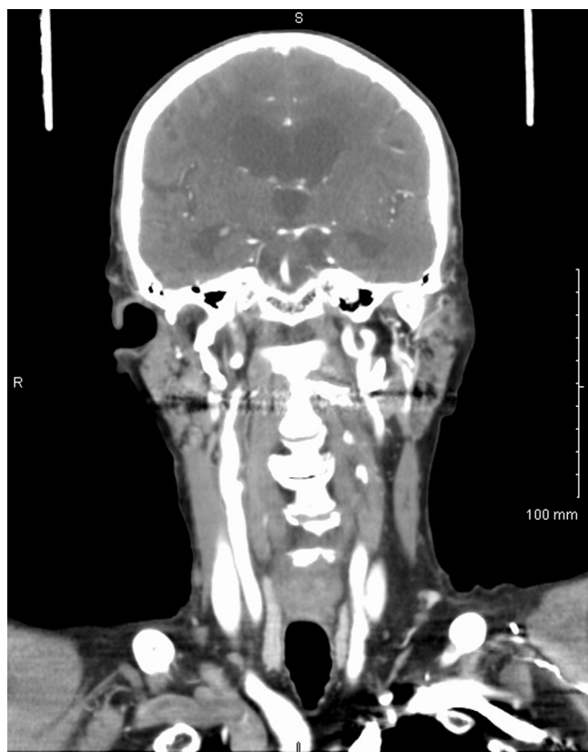
Fig. 3. A coronal CT scan of a patient with an elongated styloid hyoid complex.

length has a higher association with pain [11]. Incidences of abnormal stylohyoid length range from 4% to 7.3% [5,12]. The incidence is higher if calcification of the stylohyoid complex is included 22%–84% [13,14]. Despite the high incidence of abnormal stylohyoid complex, the incidence of pain associated with these abnormalities is 4–10% [15]. While stylohyoid abnormalities often occur bilaterally, pain usually presents unilaterally [10].