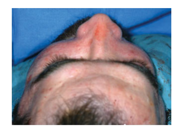
Fig. 5 Same patient after left endoscopic midface lift. (Photograph used with patient consent.)