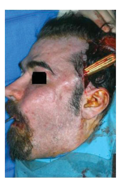
Fig. 2 Completion of subperiosteal midface elevation with connection of posttrichial and gingivobuccal incisions. (Photograph used with patient consent.)

the midface. The goal is to support and suspend the midface not beyond the patient's premorbid state in unilateral cases ( Figs. 4, 5 ) and symmetric suspension in bilateral cases. Postoperatively, cheek ptosis was evaluated at a minimum follow-up of 3 months by two blinded facial plastic surgeons. Results were graded on the following scale: excellent, no significant difference between the two sides; good, mild difference between the two sides (noticeable); fair, difference between the two sides readily noticeable; poor, severe difference between two sides for which further surgery is required.