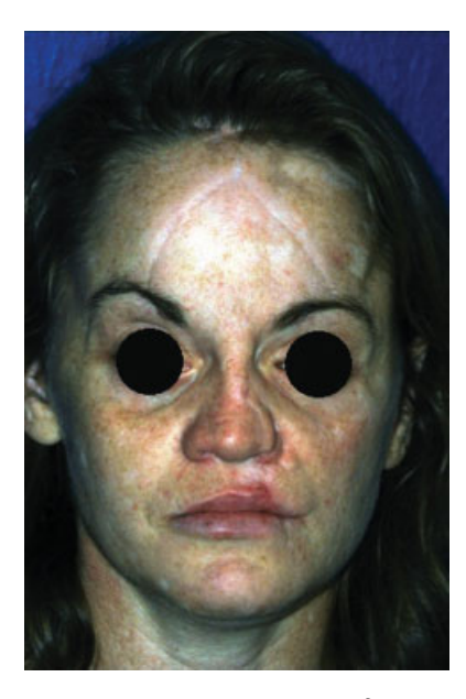
Fig. 7 Long-term postoperative appearance of previous patient following ORIF and bilateral midfacial lifting.

Cheek ptosis is the inferior displacement of the malar skin pad resulting from complete loss of periosteal attachments to the underlying facial skeleton. Four important features seen in midface aging include (1) gradual ptosis of the cheek skin below the inferior orbital rim with descent of the attenuated lower eyelid skin, creating a skeletonized appearance with infraorbital hollowness; (2) descent of the malar fat pad, with loss of the malar prominence; (3) deepening of the tear