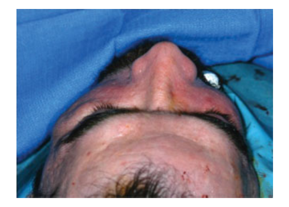
Fig. 4 Patient with severe left midfacial fractures after ORIF of bony fractures. (Photograph used with patient consent.)

Complications from ZMC fractures can result from the initial fracture and/or operative repair. Many important anatomic structures are associated with these injuries, and typical complications include diplopia, orbital entrapment, infraorbital nerve damage, and trismus. Repair of these fractures varies from surgeon to surgeon; however, the review of the literature by Meslemani and Kellman states that the important principles of ZMC repair are to treat each fracture individually and to attempt to fixate the fracture with the least amount of plating