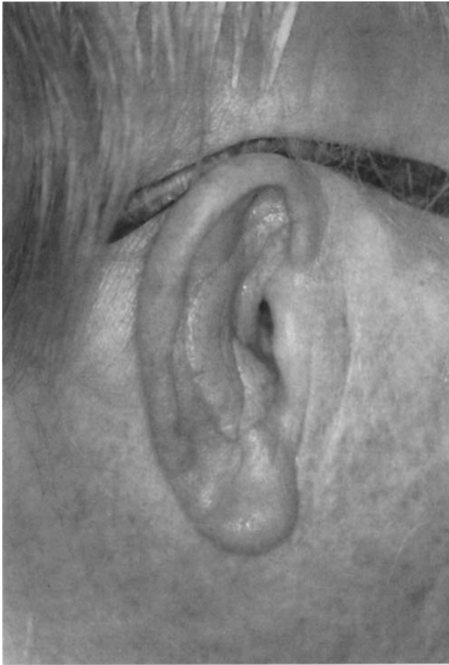
Fig. 2. Appearance of skin graft 3 months after application. Same patient as in Figure 1.

of an inch extending beyond the graft edge. This excess represents a safety factor, allowing one to secure the Aquaplast to the skin immediately surrounding the graft, without inadvertently placing sutures through the graft bed that might lead to vessel damage and possible hemorrhage beneath the graft. The Aquaplast is secured in position using either 4-0 or 5-0 nonabsorbable suture, such as nylon (Figs. 1 and 2). If Aquaplast is being used to cover a skin graft applied to a large area, such as the scalp, it may be secured in place quickly with the use of staples. The porous nature of the