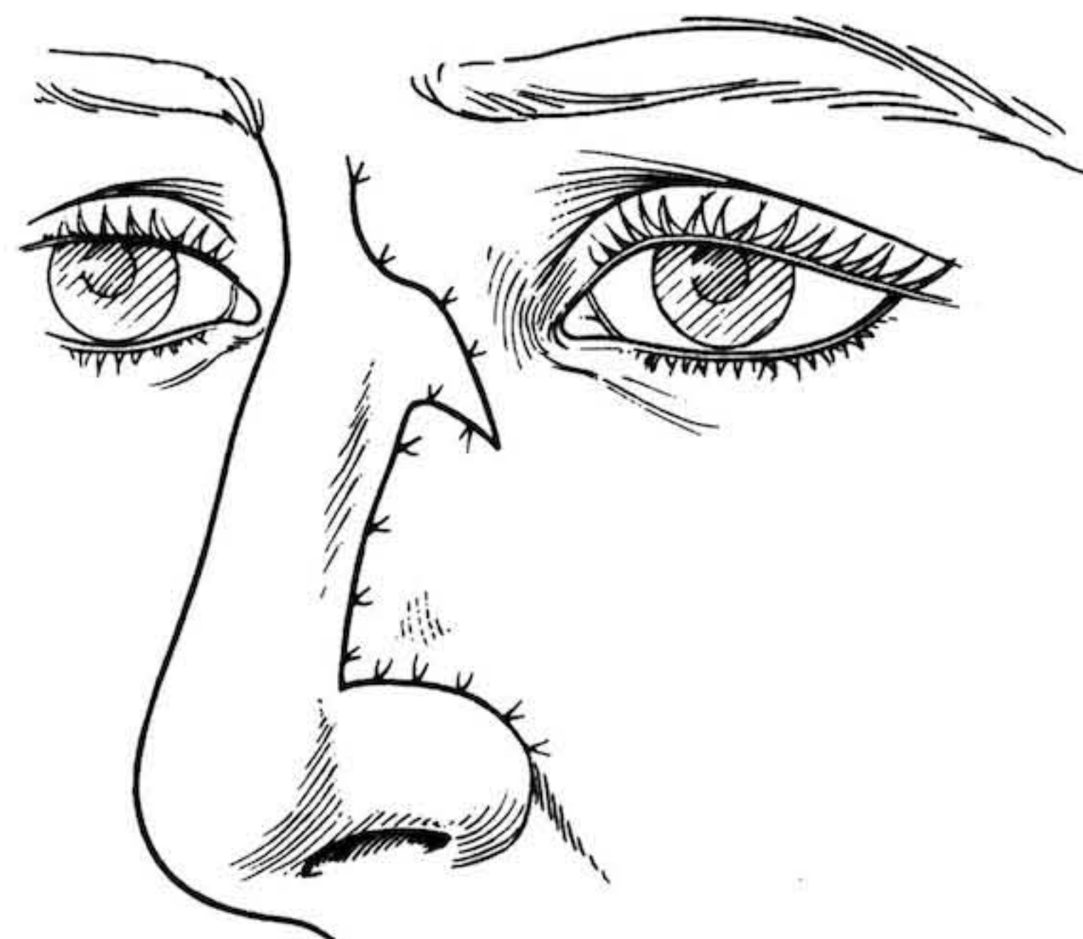
Figure 3 Defect closure. Note incisions along junctions of esthetic subunits.