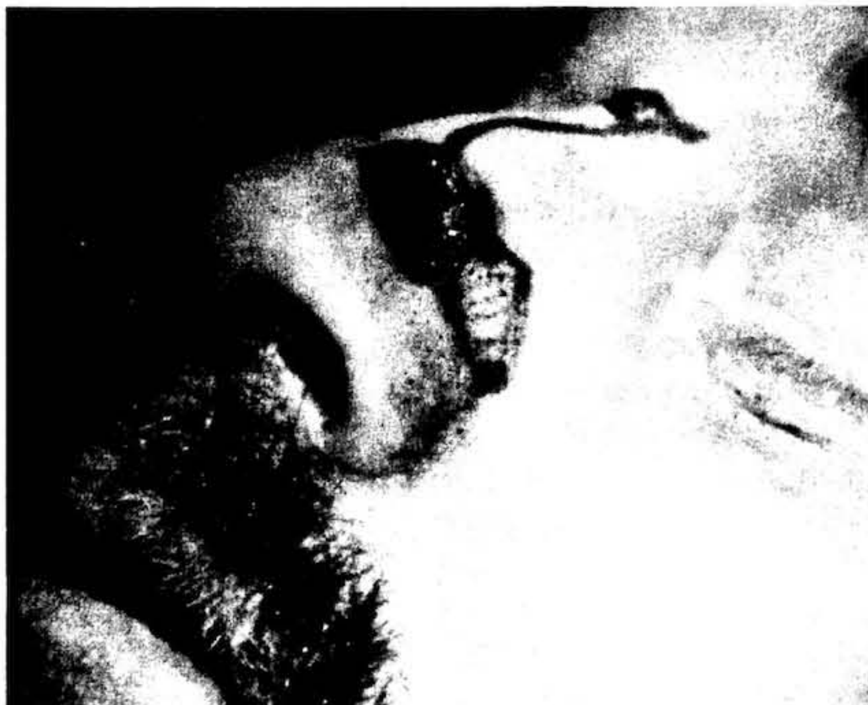
Figure 5 Intraoperative flap closure.

lize a few subcutaneous resorbable sutures to decrease any tension across the incisions, and nonresorbable sutures for skin reapproximation (Fig. 3). These are removed at 5 to 7 days after the procedure. Typically, as for most of our patients requiring flap reconstruction of external nasal defects, we perform early dermabrasion at 6 to 8 weeks following the initial repair. We have found that this provides the patient with a consistently more superior result long term. Carbon dioxide laser resurfacing of these reconstructions may be considered in place of dermabrasion but, in our hands, does not seem to provide as favourable an esthetic outcome in this patient population.