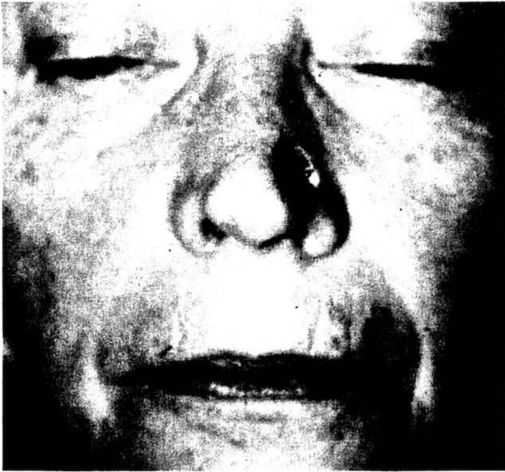
Figure 7 Nasal defect after excision of basal cell carcinoma.

lowing the junctions between the esthetic subunits of the nose. Planned excision of the standing cutaneous cone noted after flap rotation leaves a scar at the junction between the alar and sidewall subunits. Moreover, full cone excision is possible without risking devascularization of any portion of the flap. The external nose lymph drains to the facial lymph nodes primarily via lymphatic channels traversing the cheek-nose junction. This area is left intact with our flap, resulting in minimal flap lymphedema compared to the distal portion of the Reiger flap. Preservation of laterally oriented vascular channels and a favourable length-to-width ratio contributes to the venous and lymphatic drainage of our