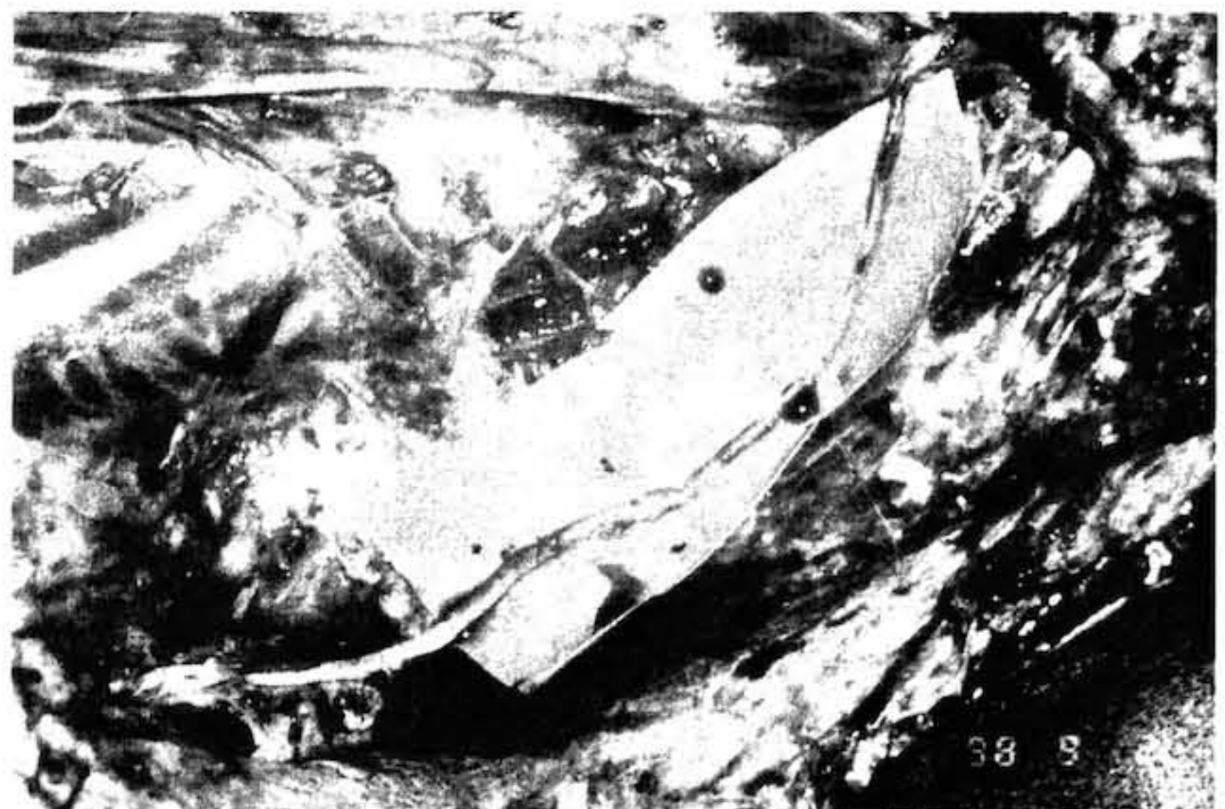
Figure 3 Interposition split sural nerve graft provides for a good size match when used for cranial nerve XI reconstruction.