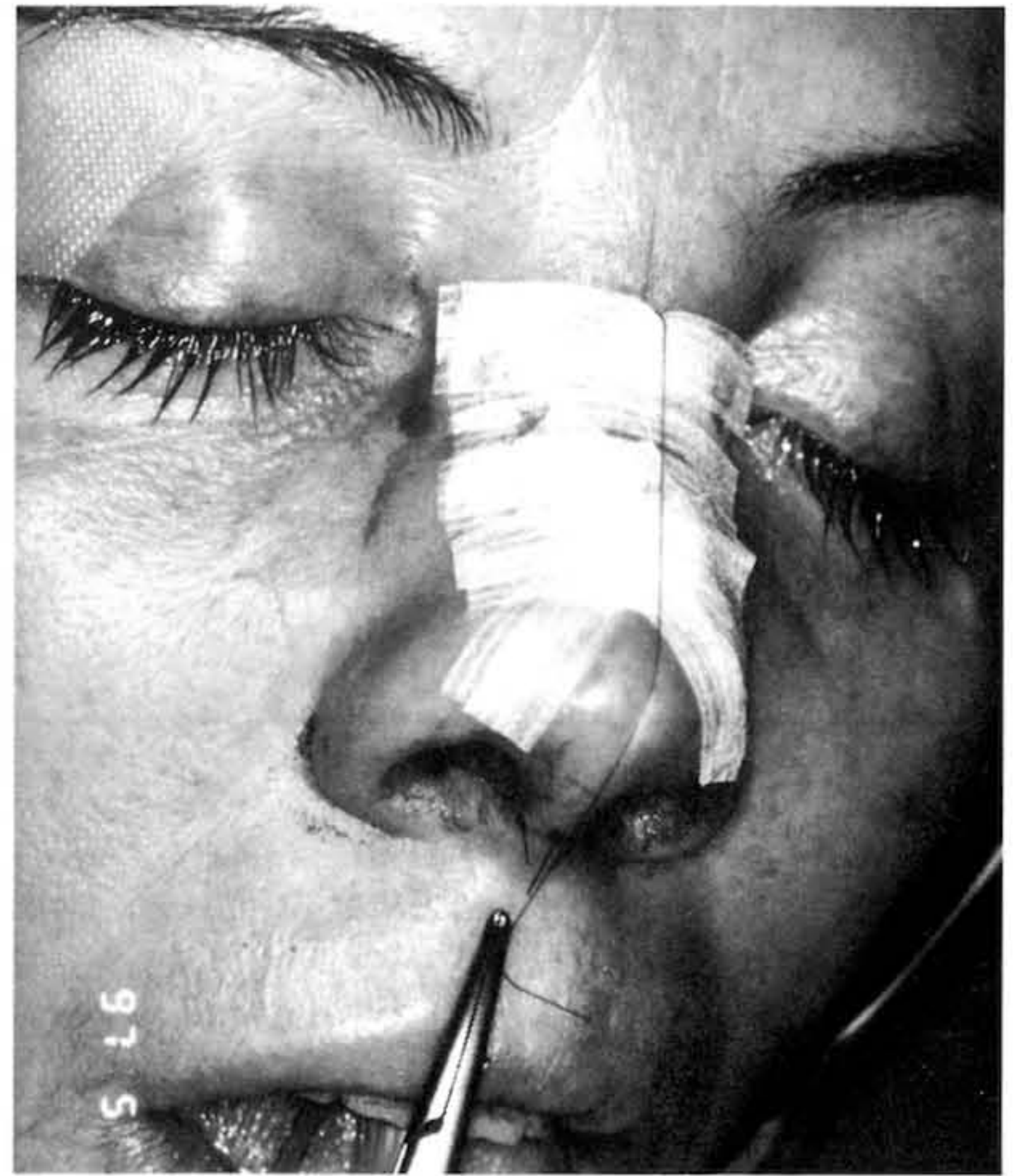
Figure 3. Dorsal nasal steristrips being applied while tension is maintained on retention suture. A second layer of steristrips on top of the suture will assure maintenance of tension on the intranasal bolster.

serve as convenient areas to pass this transcutaneous suture. Tension is applied to this suture as steristrips are affixed to the nasal dorsum (Figure 3). This suture is now secured between two layers of steristrips, maintaining tension on the intranasal bolster of Surgicel. If necessary, a second suture can be secured to the inferior end of the surgicel roll and passed through the nasal dorsum. This is a useful method of providing two point fixation to the bolster that is occasionally useful for supporting the entire nasal sidewall. A thermoplastic external nasal dressing is finally applied to the nasal dorsum in the customary manner. The external nasal dressing is left in situ for five to seven days. Once it has been removed, the transcutaneous PDS sutures are simply transected flush with the skin surface. The patient is then placed on salt water nasal sprays which will, over the course of two to three days, result in gradual dissolution of the Surgicel bolster.