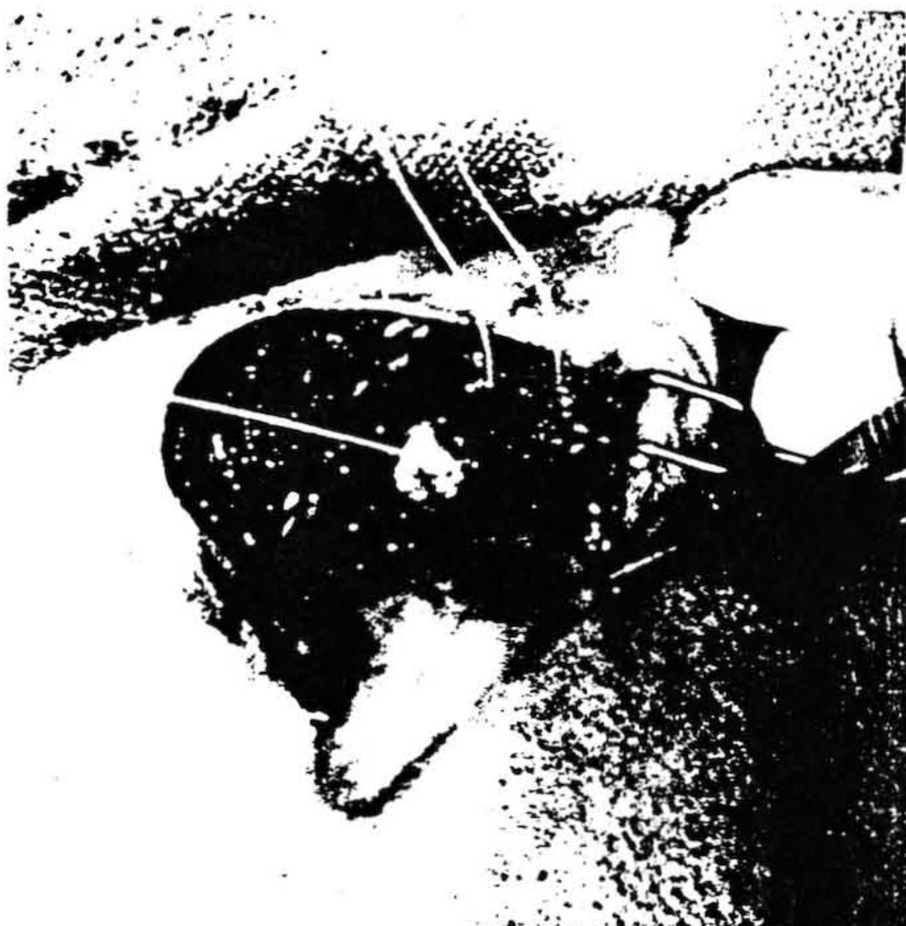
Figure 7 Placement of permanent horizontal mattress sutures along the posterior aspect of the now-defined antihelical fold.

Its major purpose is to absorb any minor drainage in the immediate postoperative period and to serve as a not-so-subtle reminder to both the patient and anyone around him or her that he or she has had an operation, thus, hopefully, minimizing incidental contact. After dressing removal, we advise our patients to wear a sup-