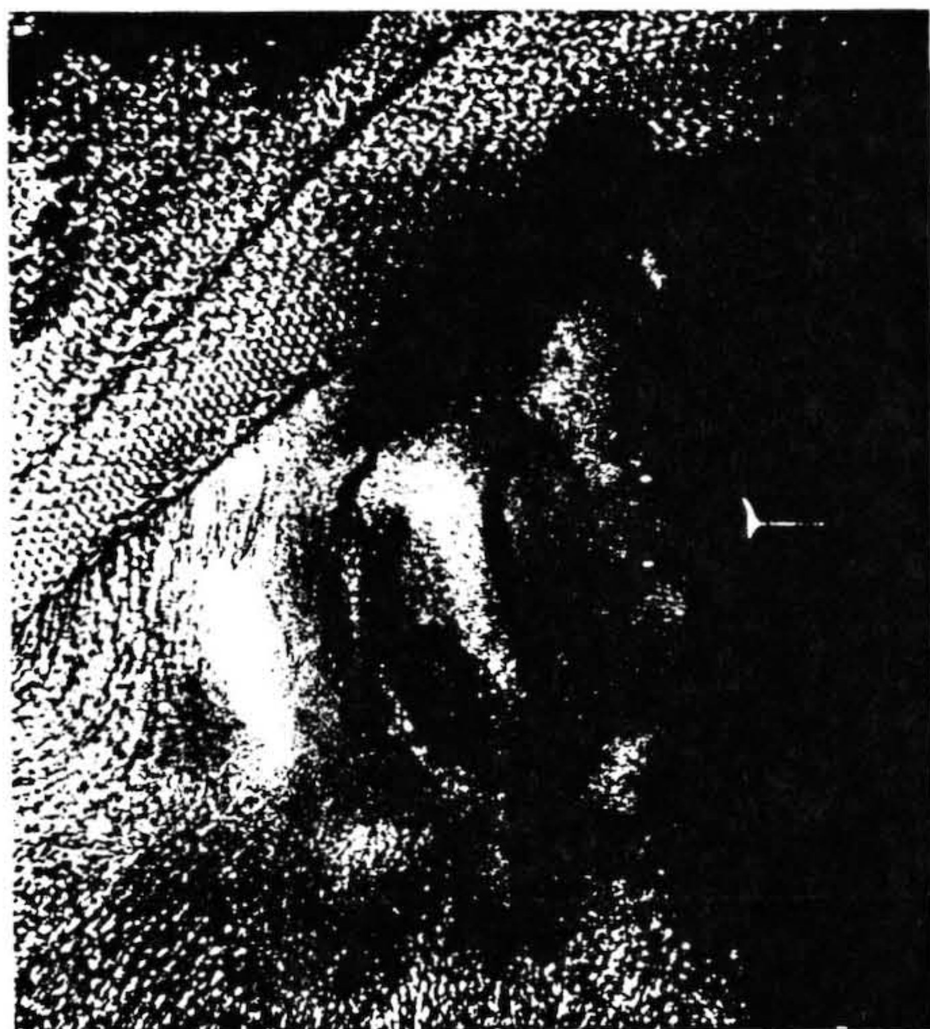
Figure 1 Skin markings delineating an elliptical skin excision.

First, the surgeon needs to determine the degree of prominence of the upper third and the lobule. Prominence in these areas needs to be addressed by extending the initial curvilinear elliptical skin excision into these specific areas (Fig. 1). The more significant the degree of prominence present, the greater should be the exten-