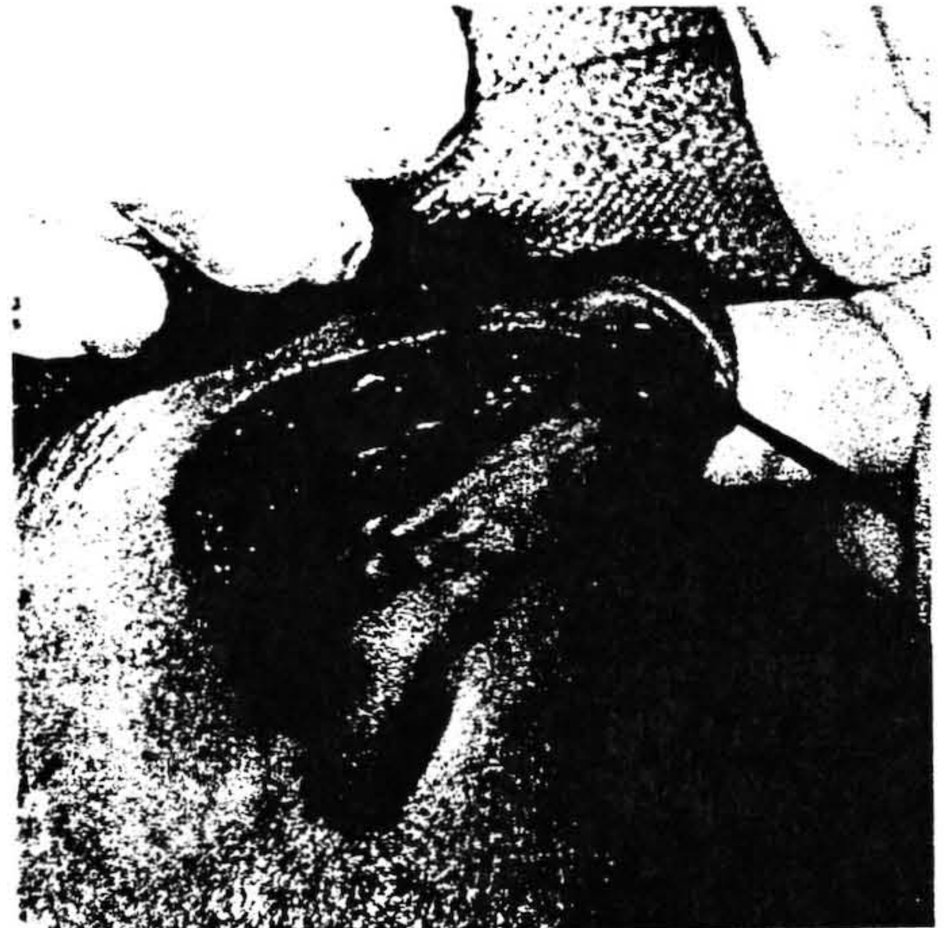
Figure 5 Cross-hatching along the posterior demarcations of the antihelical fold will facilitate curling of the antihelical fold with suture placement.

The key element of the dressing is the molded bolster, which effectively prevents hematoma formation and maintains the contours of the auricle in the immediate postoperative period. All that is required is a moderate quantity of Betadine ointment and cotton balls. These are then mixed together into a malleable mass, from which are derived three basic elements: a large conchal bowl piece, a linear scaphal piece, and an intermediate postauricular piece. These are then placed in situ without the need for suture fixation (Fig. 9). As the Betadine-cotton ball mold dries in the hours after the operative procedure (under the cotton dressing), it hardens and adheres to the underlying auricular skin, providing for reliable bolster-like effectiveness. The lack of suture fixation of this dressing allows for painless dressing removal, an obvious benefit for all patients, especially children. A standard cotton head wrap is then employed for 5 to 7 days postoperatively. It serves only a minor role in protection of the operated auricles.