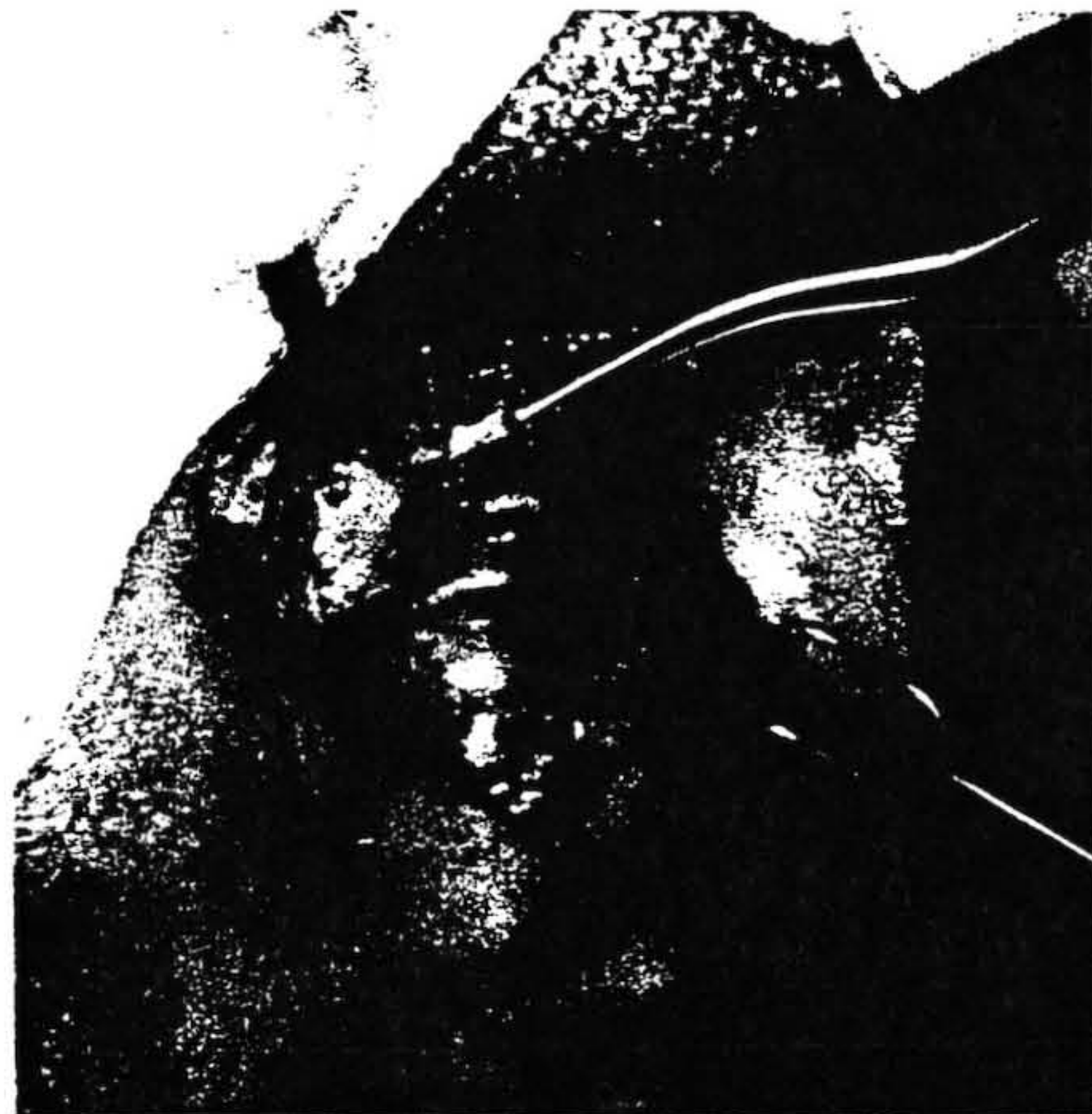
Figure 2 Removal of a 1-cm strip of premastoid fascia to allow the auricle to settle more naturally after conchomastoid fixation-suture placement.

After marking the desired site of the future antihelical fold on the anterior aspect of the auricle (if required), 27-gauge needles are passed through the demarcated line from anterior to posterior (Fig. 4). Once the needle tip has emerged posteriorly, methylene blue is applied to the tip as it is withdrawn. This will translate the anterior fold design into a series of accurate posterior markings. Applying the methylene blue to the needle tip prior to passing it through the auricle results in unnecessary smudging of the markings. At this juncture, a number 15 scalpel blade is used to score the line of posterior markings to weaken the cartilage in this area (Fig. 5). This localized weakening of the cartilage will allow for easier