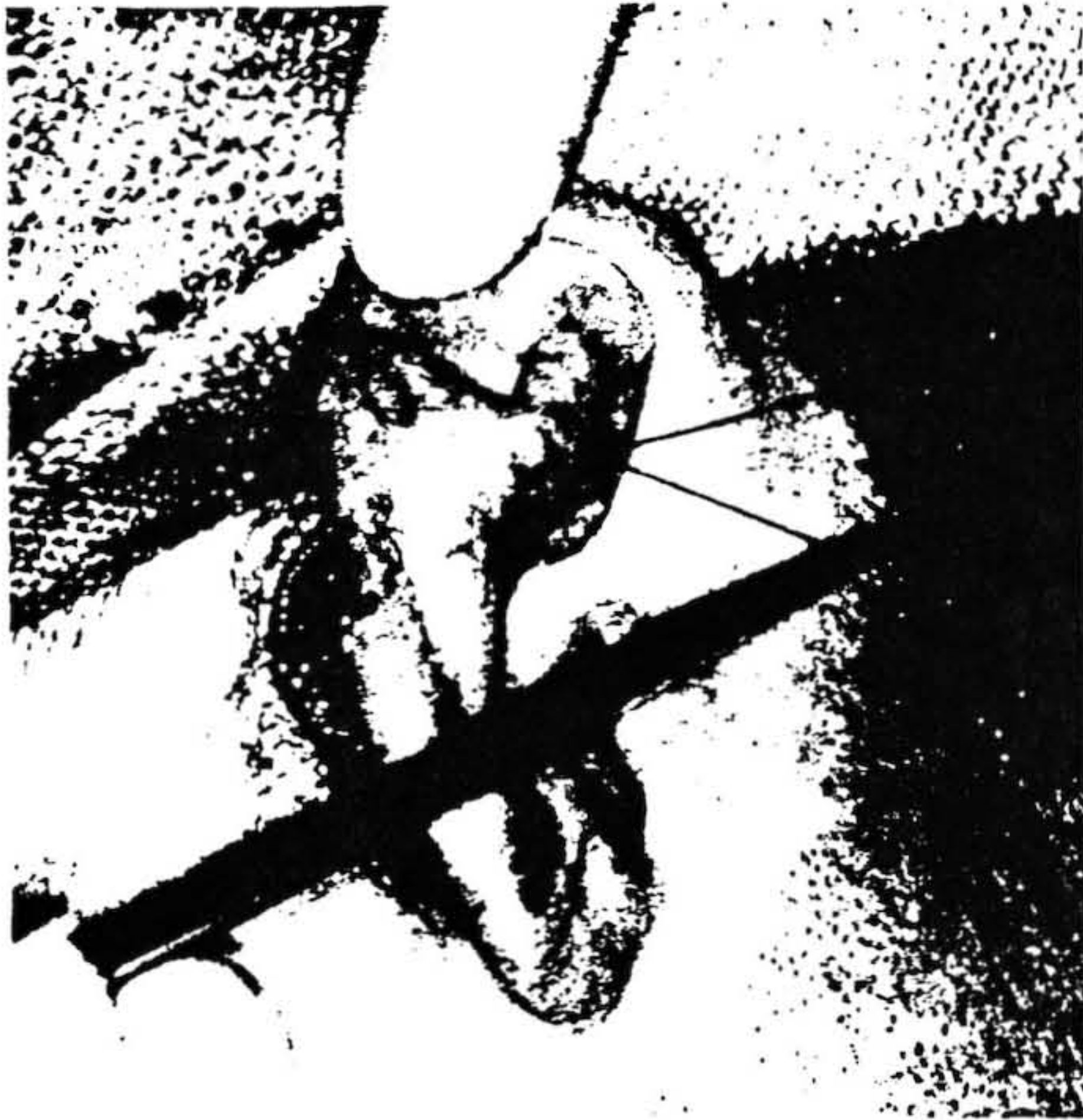
Figure 6 Placing temporary sutures along the anterior aspect of the antihelical fold allows for tension-free maintenance of desired fold position and contour while permanent sutures are placed posteriorly.

Its major purpose is to absorb any minor drainage in the immediate postoperative period and to serve as a not-so-subtle reminder to both the patient and anyone around him or her that he or she has had an operation, thus, hopefully, minimizing incidental contact. After dressing removal, we advise our patients to wear a sup-