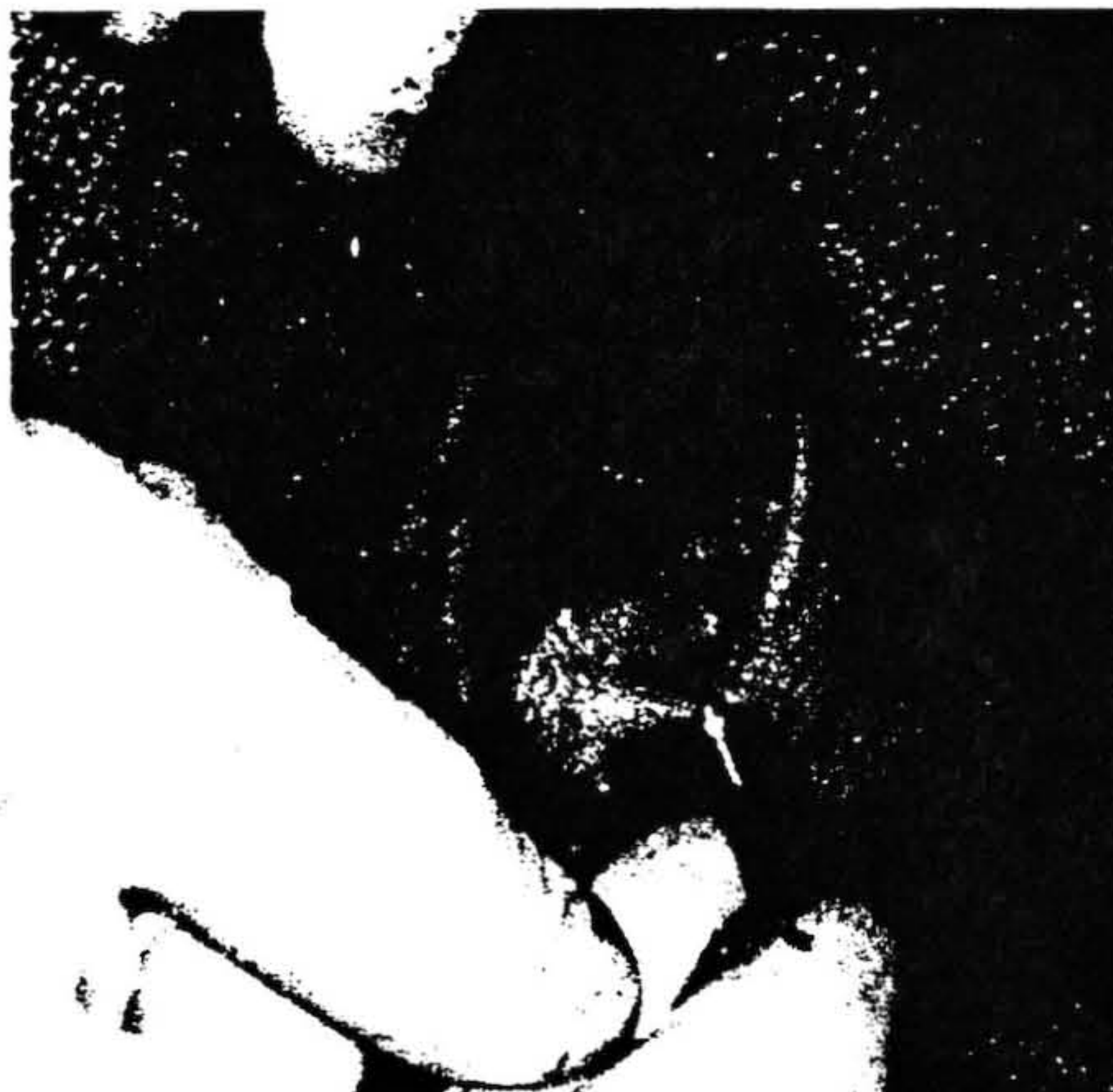
Figure 4 Passage of a 27-gauge needle from anterior to posterior along the planned site of the new antihelix. Methylene blue is applied to the needle tip prior to its removal. This effectively translates the anterior markings with a minimal of smudging.

neo-antihelical-fold contour suture fixation. To facilitate placement of cartilage-molding postauricular sutures, one or two temporary 4.0 silk sutures are placed anteriorly