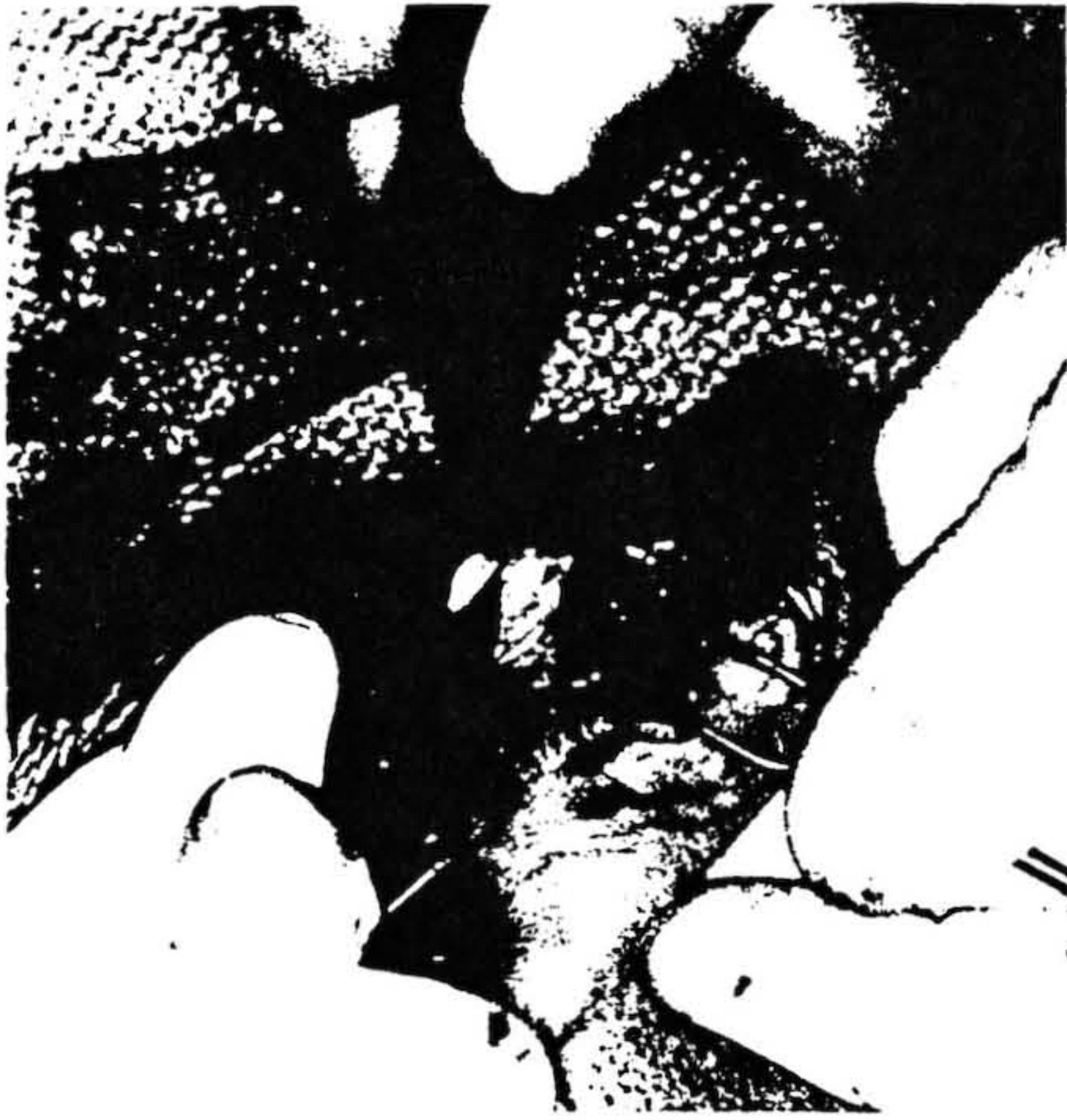
Figure 3 Excision of cartilaginous disks at "contact points." Contact points represent areas where the postauricular cartilage significantly abuts (or "contacts") the preauricular tissue when the auricle is pulled back. Removal of an adequate number of these disks is assured when the auricle momentarily "sticks" to the preauricular tissues when pulled back.

neo-antihelical-fold contour suture fixation. To facilitate placement of cartilage-molding postauricular sutures, one or two temporary 4.0 silk sutures are placed anteriorly