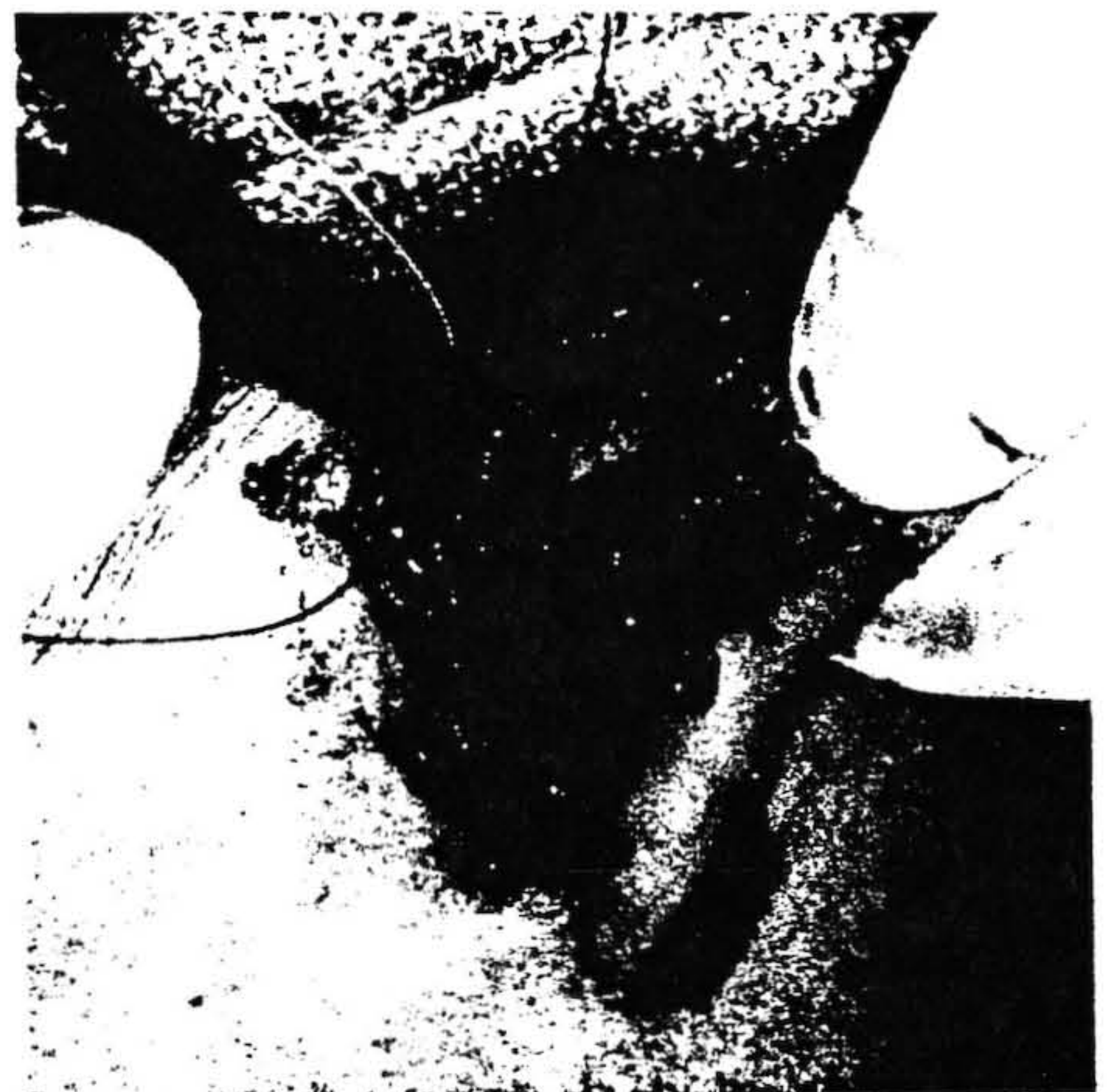
Figure 8 Conchomastoid suture fixation should be free of any tension, if the previous maneuvers were executed correctly.

Otoplasty is ideally a very rewarding procedure that significantly alters an affected patient's overall facial appearance. The most common complication following