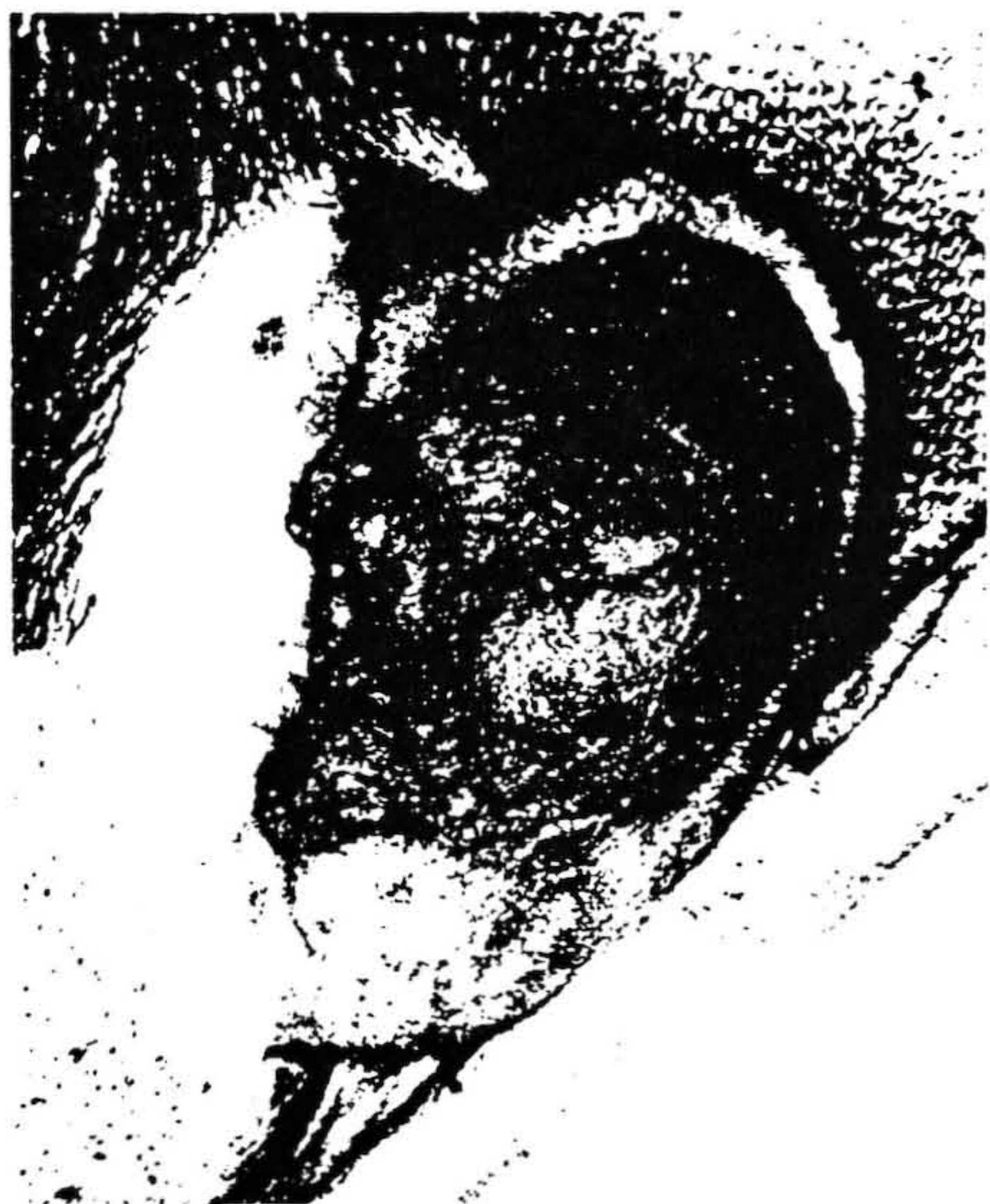
Figure 9 Moldable dressing in position.

surgical correction of prominent ears is a poor esthetic outcome resulting from either undercorrection or overcorrection. Often, inadequate correction follows incomplete assessment of the specific constellation of deformities that are present in the individual patient. Spira and