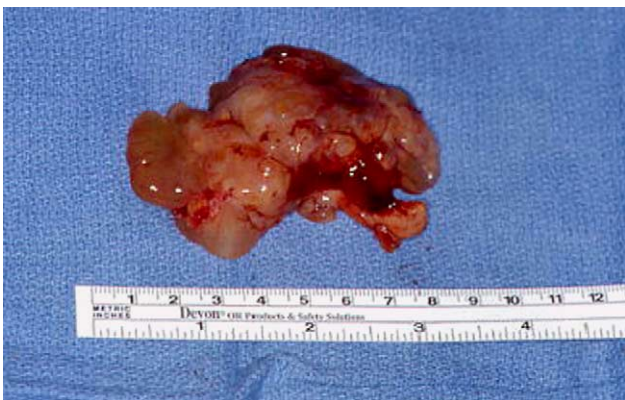
Fig. 2. Gross appearance of frontal sinus hamartoma demonstrating multicystic jelly-like consistency that was firm.

The orbital roof was completely involved with the mass and was excised along with mass. The mass was removed