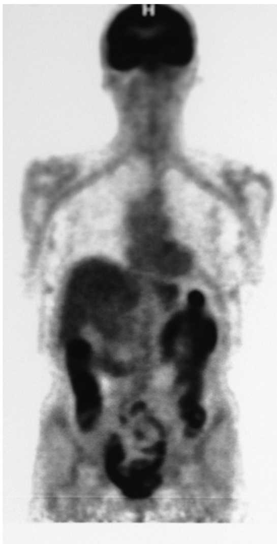
Fig. 1. Positron emission tomography scan demonstrating a positron emission tomography–avid lung metastasis in a patient with known massive primary basal cell carcinoma of the left face, nose, orbit, and base of intracranial fossa with dural involvement.

A total of 9 patients were available for review as defined above. The male/female ratio was 5:4 with a mean age of 63.2 years at presentation (range, 42–72 years). The average