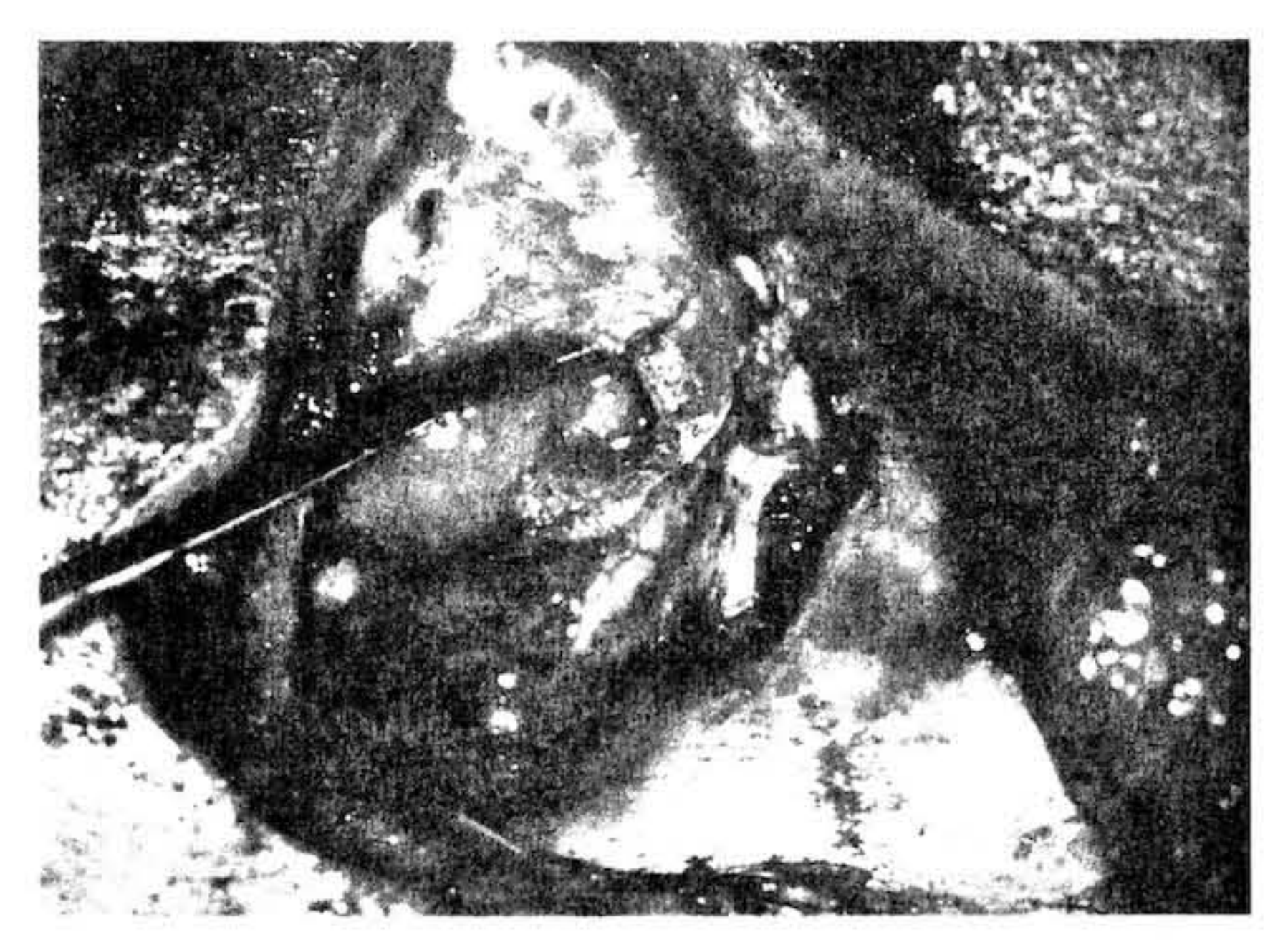
Figure 2 Intraoperative photograph taken via lateral rhinotomy approach. Note elevator between caudal margin of nasal bone and nasal mass.

removed in continuity with the main specimen. Further dissection more posteriorly revealed the presence of a second distinct tract measuring 1.0 cm in diameter leading to the floor of the left anterior cranial fossa (Fig. 3). This, too, was removed in continuity with the nasal lesion after intracranial exposure of the left side was obtained (Fig. 4). Pathologic analysis revealed the presence of benign astrocytic neuroglial cells in a fibrous stroma, pathognomic of intranasal gliomas. The patient's nasal dorsum was reconstructed with a split calvarial bone graft. The patient has done well postoperatively with no evidence of intranasal disease or cerebrospinal fluid leakage (Fig. 5).