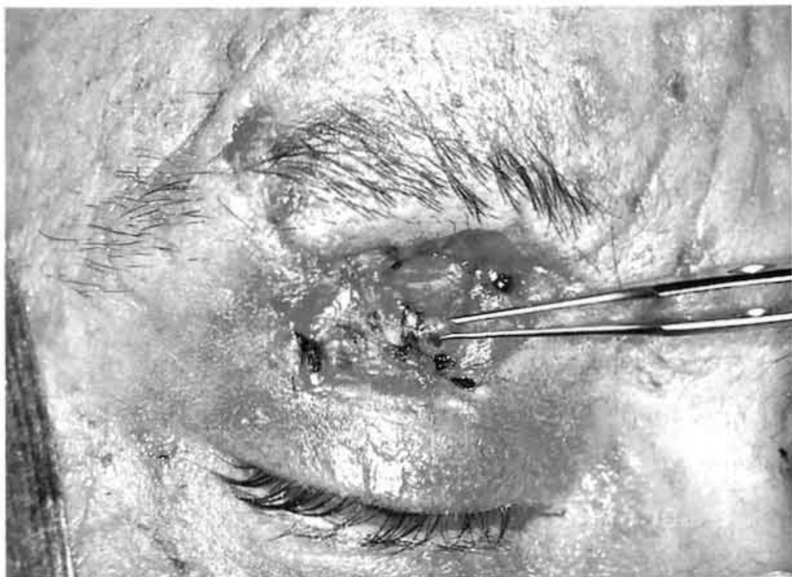
Fig. 1. Full thickness upper eyelid defect. Forceps demonstrating osseous exposure of the superior orbital rim.

After initial emergent treatment of his serious life-threatening injuries, the patient developed adult respiratory distress syndrome and a persistent intestinal fistula. Renal and hepatic function also adversely affected this patient.