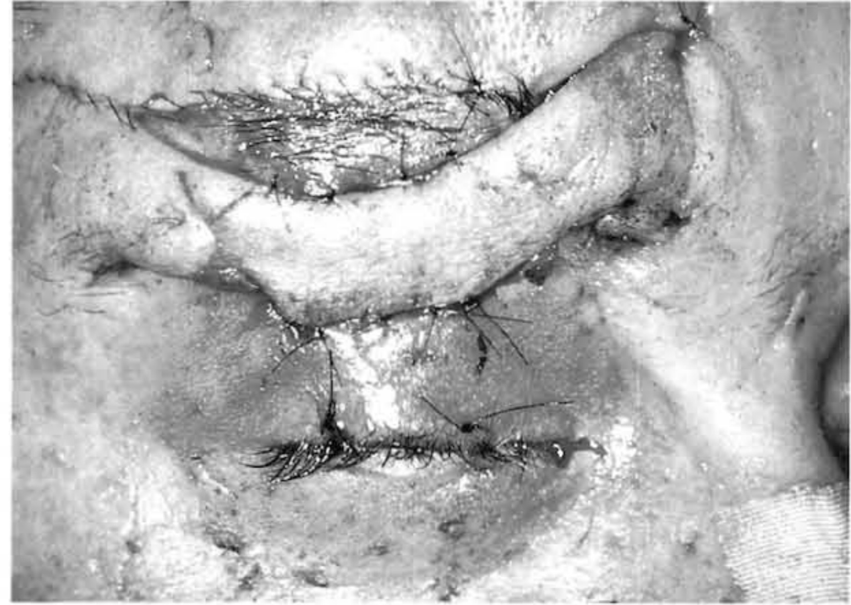
Fig. 4. Initial flap insetting.