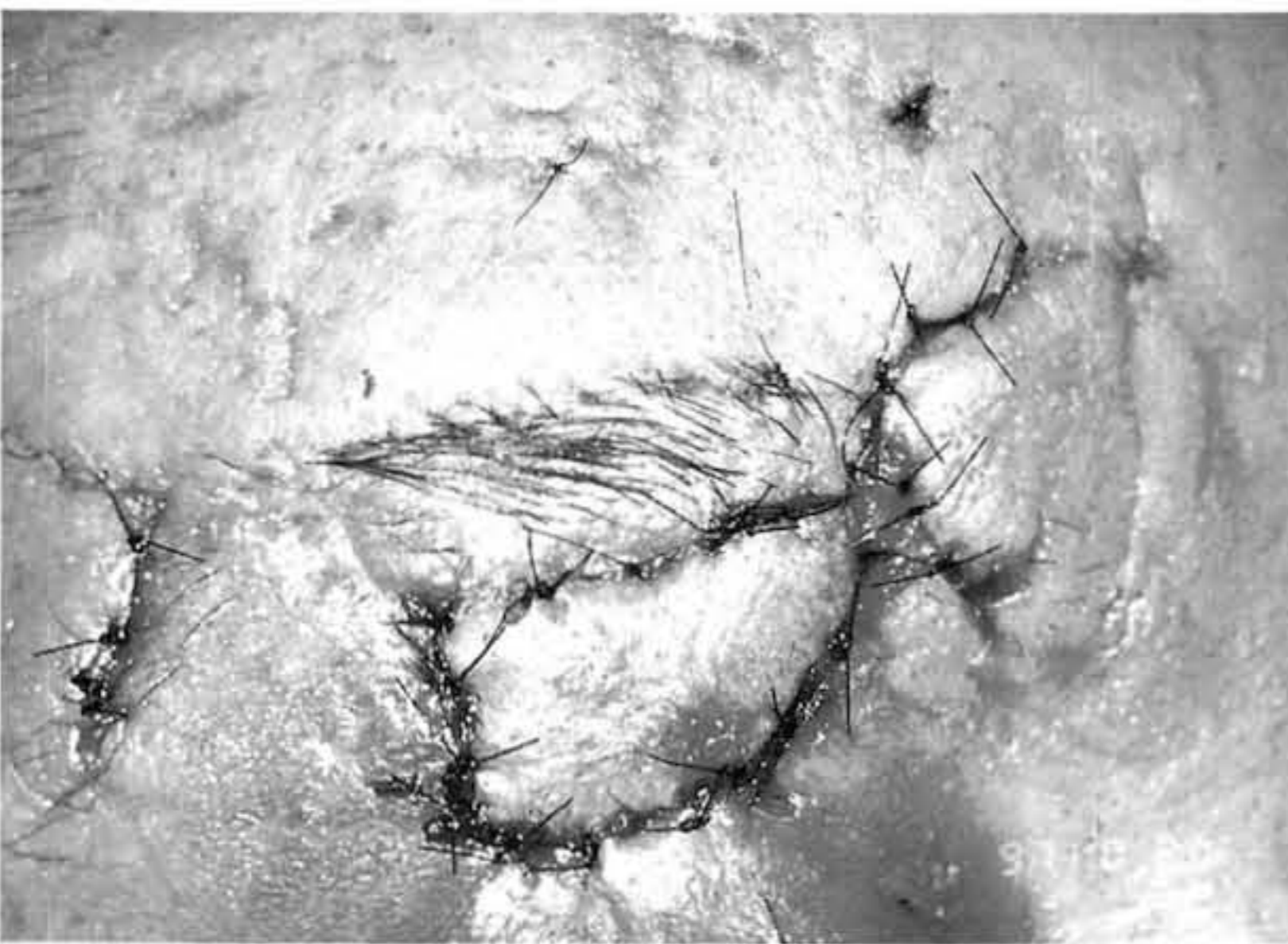
Fig. 5. Final flap insetting.

the supraorbital area, we felt it was relatively less safe to utilize only a singly pedicled flap, based either medially or laterally.