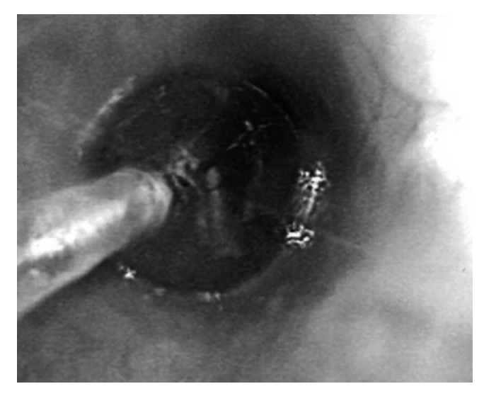
Figure 3. View from below of the distal end of the balloon dilator in position within the esophageal stricture.

All of the study patients were unable to be dilated antegrade with both bougie dilation and balloon dilation. No lumen was visible on preoperative swallowing studies. As one would expect, all of these patients (four females, two males; average age 56.5 years) were completely dependent on a gastrostomy tube and unable to handle oral secretions. All had received radiation therapy for a head and neck carcinoma, and four of the subset had received concurrent chemotherapy. All of the complete strictures were able to be transilluminated with the