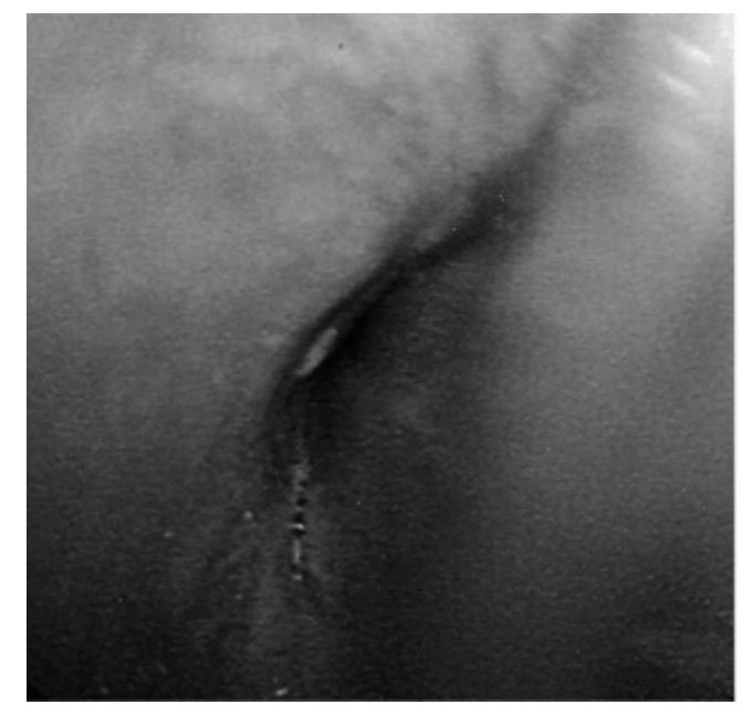
Figure 2. View from below of the cervical esophageal stricture.

postcricoid region was found to be widely patent after her previous dilation to 20 mm. She remains dependent on a gastric tube secondary to aspiration confirmed on videofluoroscopy owing to her remaining true vocal cord to adequately protect her airway. She is able to take small sips of liquids for comfort. Follow-up contrast swallow examinations have revealed a patent hypopharynx. She was followed for 16 months after her last dilation without recurrence of dysphagia.