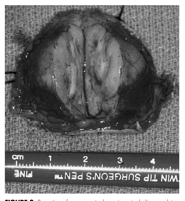
FIGURE 2. Resection of gross surgical specimen including overlying skin. No evidence of cutaneous origin or extension was noted on histopathologic evaluation despite gross and microscopic evidence of melanoma in the 4-cm lymph node.

other cancer. There was no history of a previous skin biopsy or of past treatment of any skin lesions. However, she did report having had a long-standing pigmented nevus on the left cheek, measuring approximately 1 cm in dimension, that had been present since childhood. During the 1 year before presentation, this lesion progressively darkened in color, tripled in size, and developed an irregular border, according to the patient. However, the patient did not seek