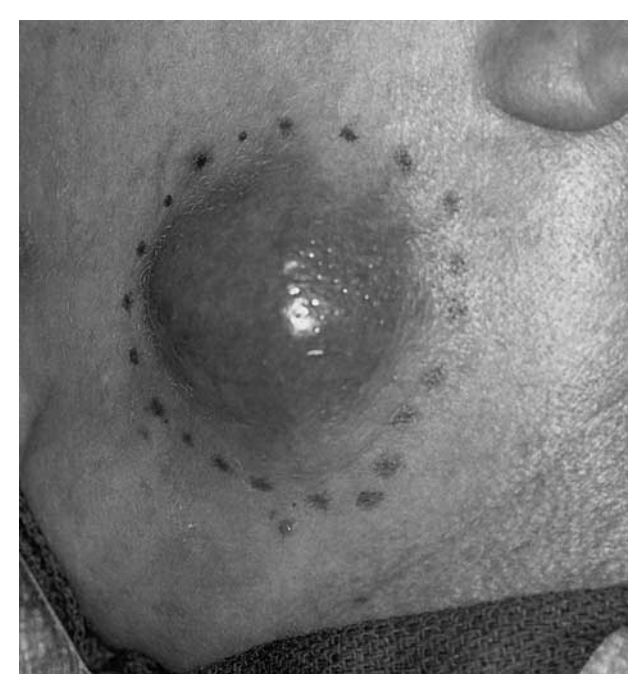
FIGURE 1. Erythematous subcutaneous nodule, preoperative clinical presentation. Mass represented metastatic melanoma within a left facial lymph node.

A 57-year-old Caucasian woman in otherwise good overall health with no known medical problems presented with a 3-month history of a progressively enlarging subcutaneous nonpigmented, erythematous, nonpainful nodule superficial to the left angle of the mandible (Fig 1). On questioning, the patient denied a previous history of cutaneous or any