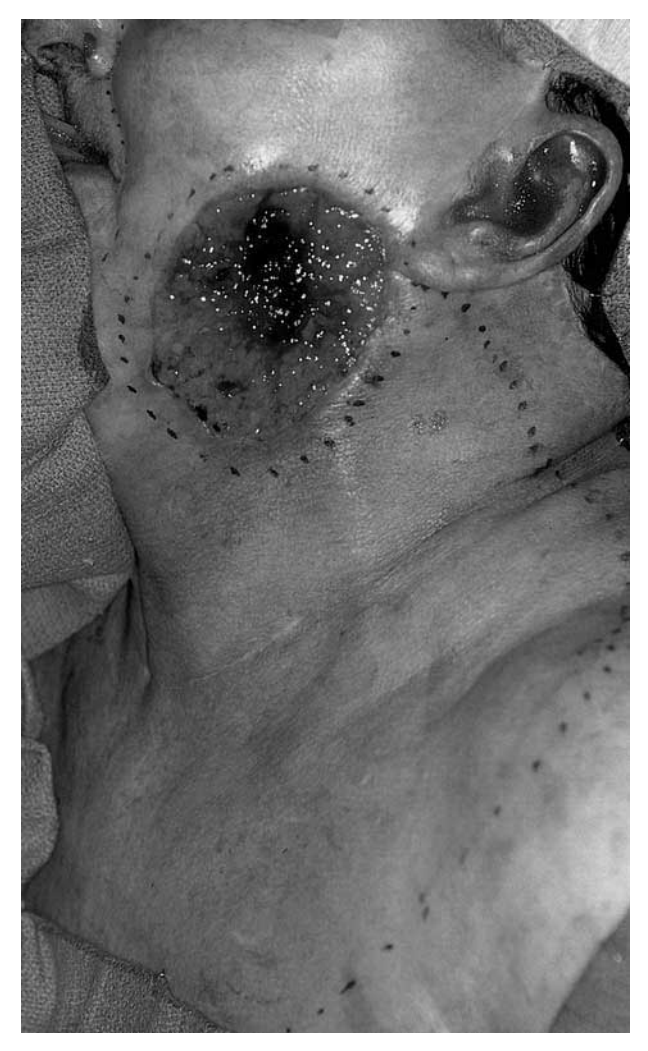
FIGURE 5. Surgical defect with preparation for chest-neck rotation flap.

upper gastrointestinal series with small bowel examination revealed completely normal findings. Computed tomography scans of the head, neck, chest, abdomen, and pelvis, as well as bone scans, likewise revealed unremarkable findings.