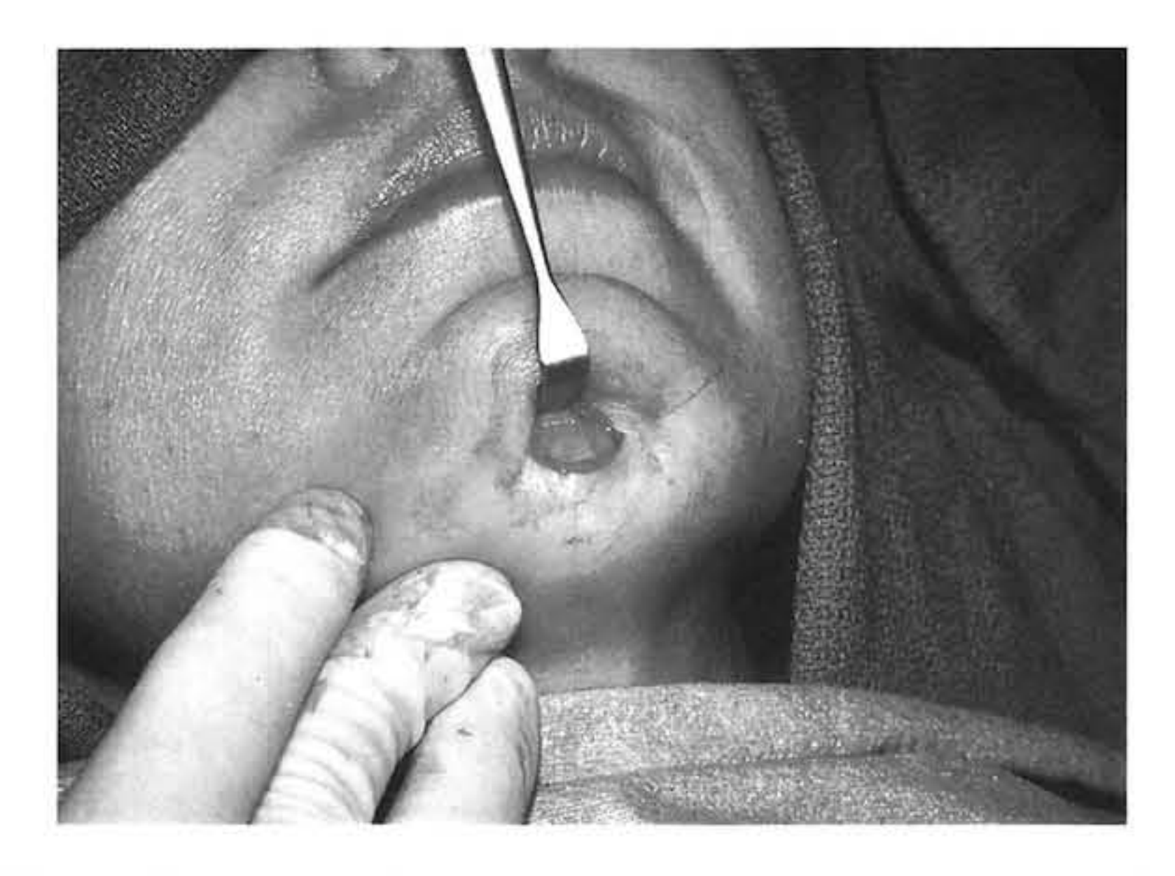
Fig. 4. External incision providing access to the anteroinferior-most portion of the mentum.

cephalosporin or equivalent) are utilized routinely for seven days, although the absolute need for this remains unproven. The patient is instructed to wear a jaw bra for one week continuously and then nightly for a further two weeks.