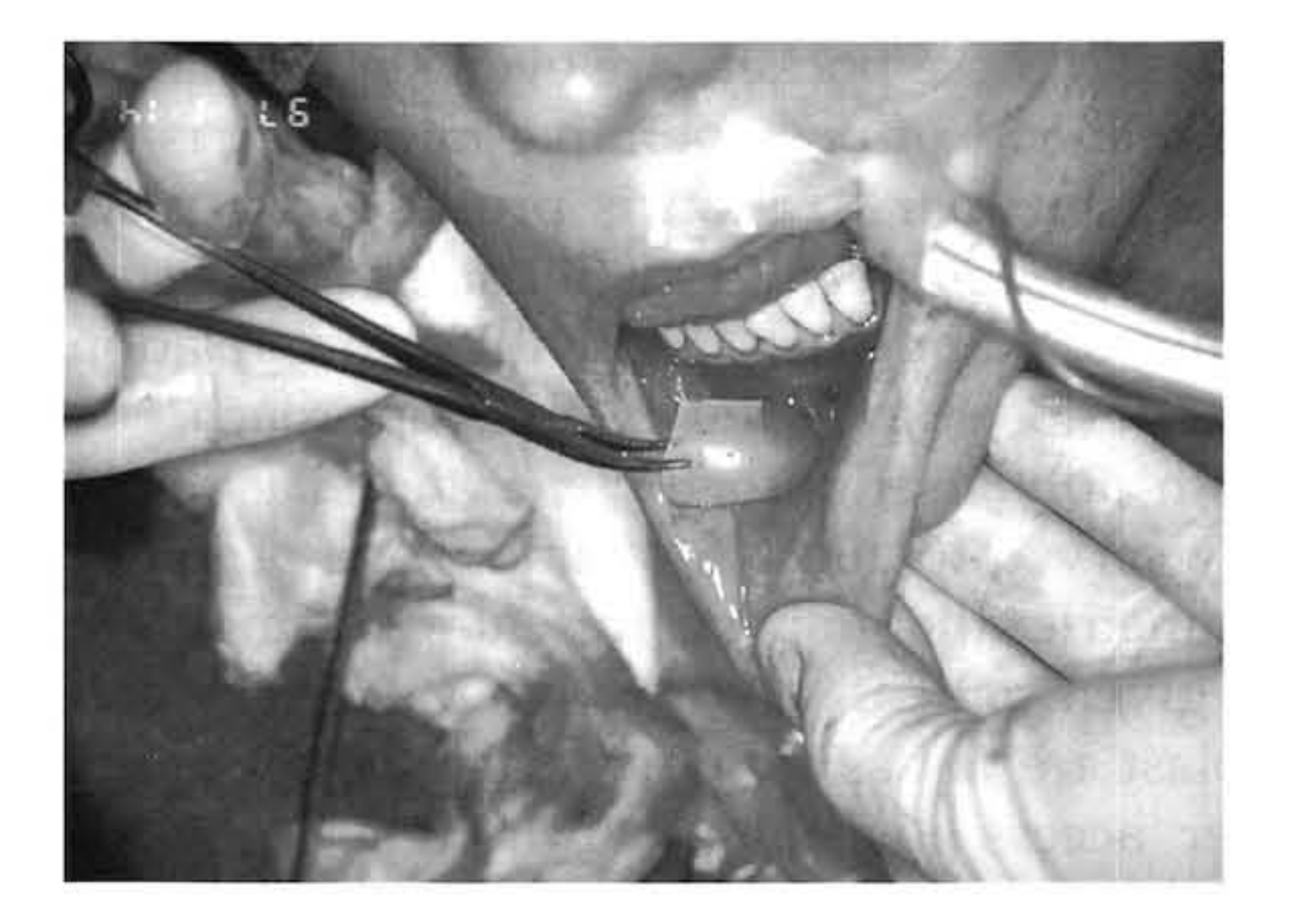
Fig. 3. Implant being introduced into subperiosteal pocket which has been precisely elevated.

cephalosporin or equivalent) are utilized routinely for seven days, although the absolute need for this remains unproven. The patient is instructed to wear a jaw bra for one week continuously and then nightly for a further two weeks.