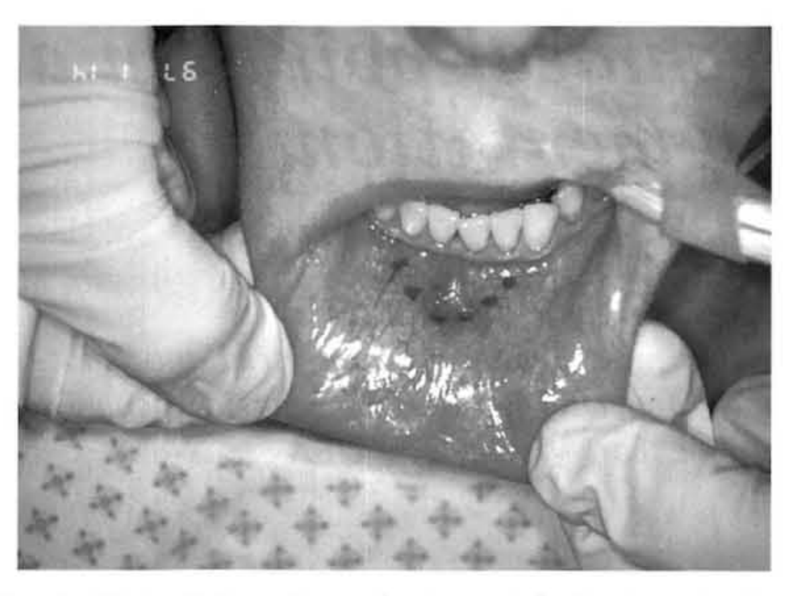
Fig. 1. Note delineation of planned half circle incision centered on the midline frenulum.

Chin augmentation may be performed either with the use of general or sedation anesthesia. The choice should be left up to the discretion of the anesthesiologist under the guidance of the patient.